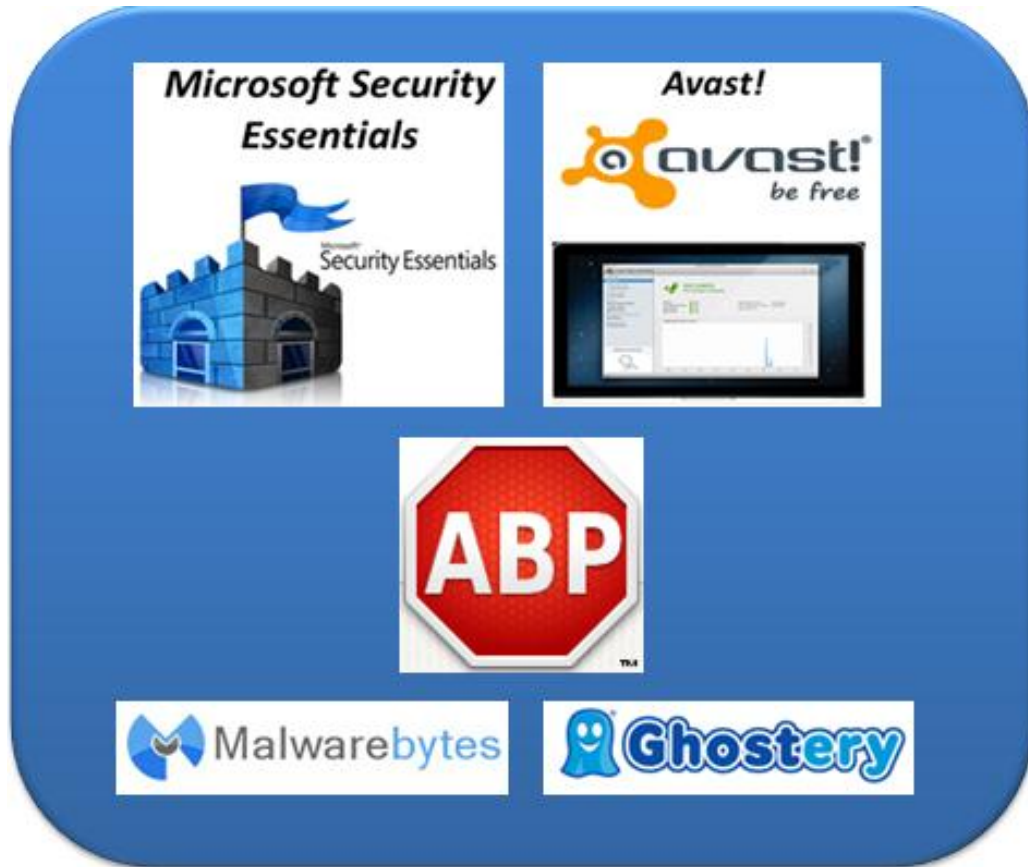
Figure 2. The Best Malware Protection Software