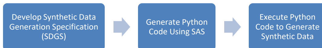
Figure 1 Data Generation Workflow

Generating structured data involves several steps, which are illustrated in the following workflow: