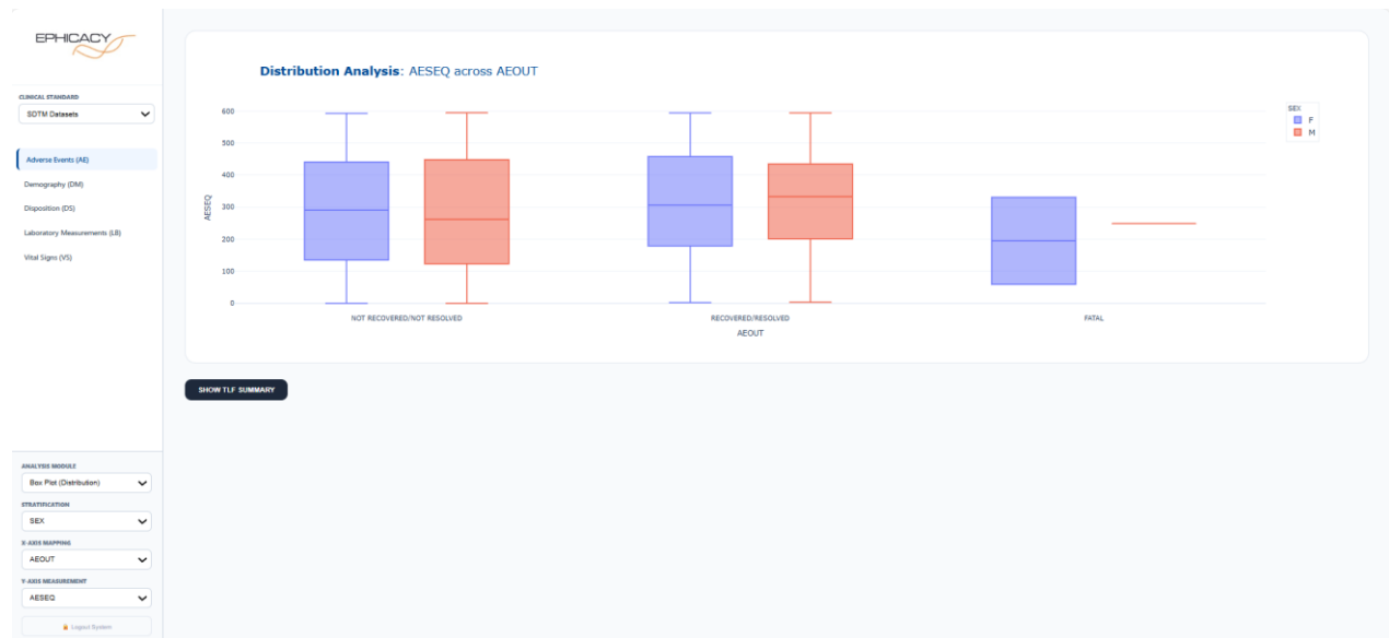
Figure 1. Dynamic Standard Selector and Module Navigation featuring Proportional Logic

This summary is hidden by default to maintain a clean visual workspace but can be toggled by the stakeholder for deep-dive statistical review.