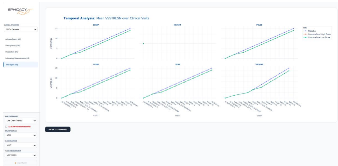
Figure 3. Faceted Line Chart showing Trends in Vital Signs (VS) by Visit and Treatment Arm

To handle the complexity of clinical data, the tool automatically facets these charts by categorical parameters like LBTESTCD or VSTESTCD. For instance, a stakeholder can view a grid of line charts showing the mean change in Blood Pressure, Heart Rate, and Respiratory Rate over multiple clinical visits, grouped by ARM or SEX . This allows monitors to identify treatment-emergent trends or systemic outliers across the entire study population in a single view.